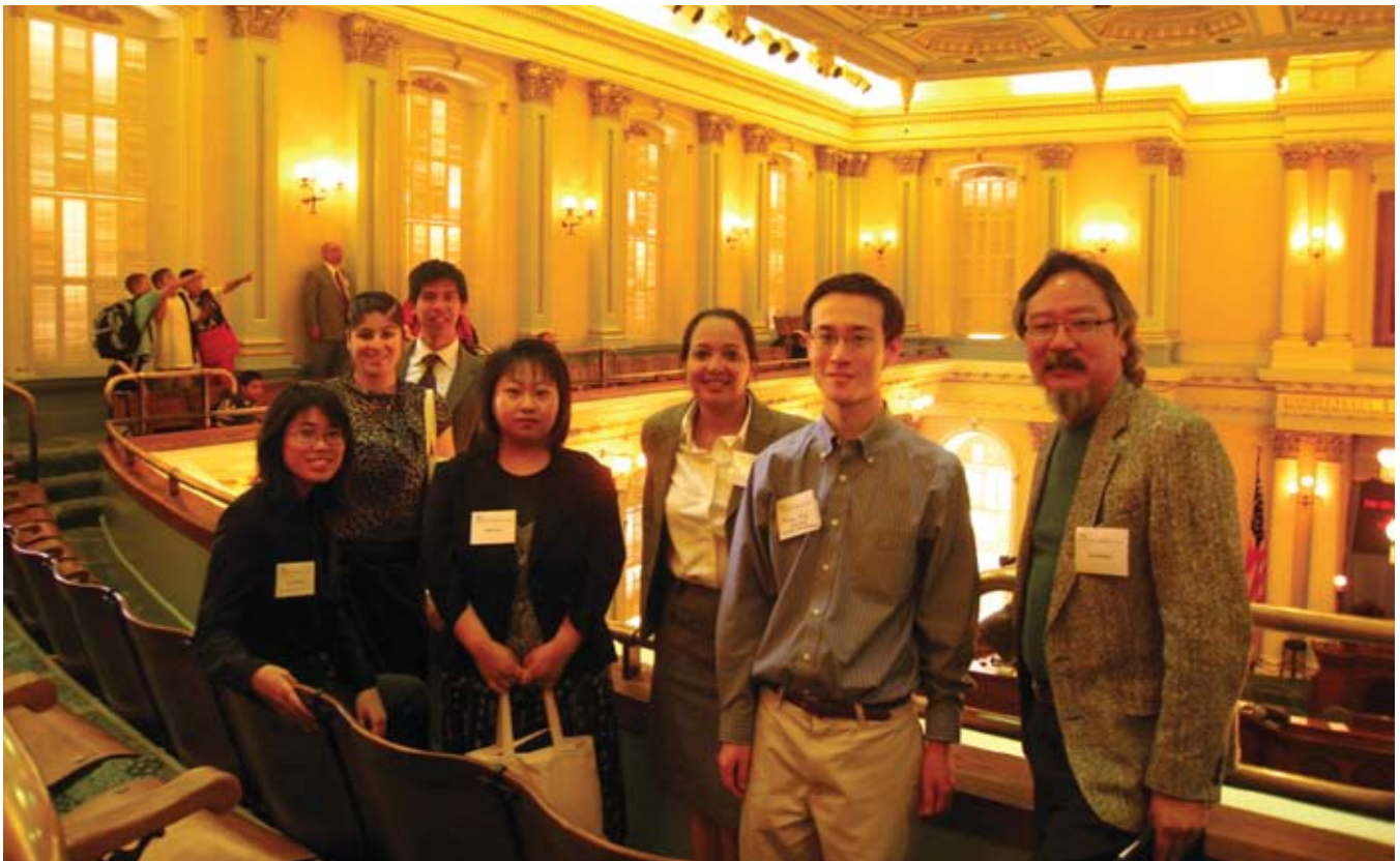
The Caucus-led civil rights advocacy team visited the California Assembly Chambers in the Sacramento Capitol during the annual API Policy Summit (photo courtesy of Tracy Tzerling Huang).

While progress has been made, public policy and laws continue to overlook or ignore the needs of many Asian and Pacific Islander communities. In all our program areas, the Asian Law Caucus empowers community members to participate in the struggle to change unfair or inadequate government policies and laws, including increased voting and direct advocacy. We believe that meaningful change can occur through civic participation.