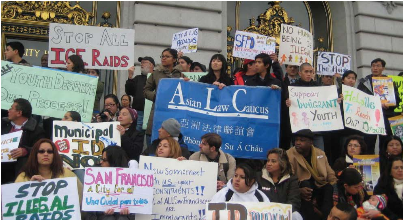
A multi-racial coalition of San Francisco residents expressed its demands for stronger protections for immigrants at the International Migrant Day rally at San Francisco City Hall in December 2008.

Creating a realistic path to permanent residency that strengthens our country and keeps families together is one of the Asian Law Caucus's major commitments. We provide legal services to those in greatest need while also engaging in the public debate to support proposals that champion a more humane and just immigration policy.