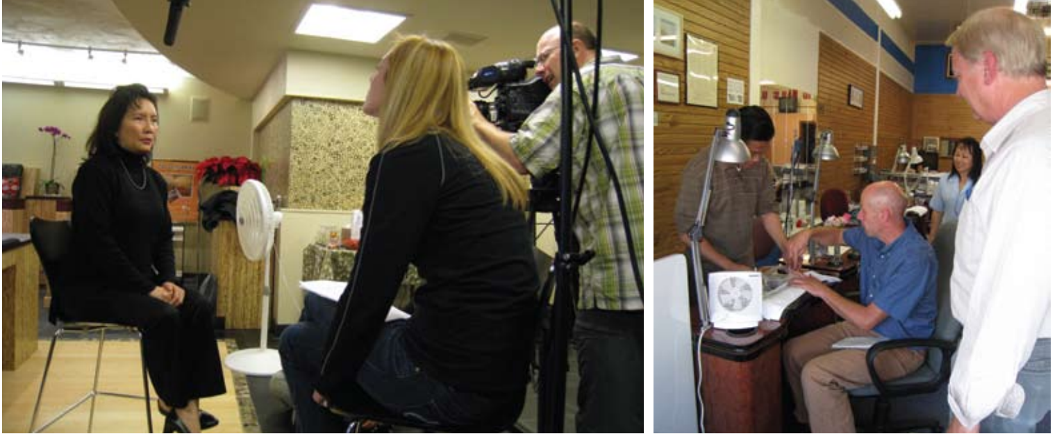
Focus on the nail industry (left to right): a Canadian film crew visits a shop in San Francisco to interview the owners about their efforts to operate a “green” business; a salon owner shows Cal/OSHA inspectors how acrylic nails are applied under industry standards that promote work place health and safety.

In recognition of a significant concentration of Asian and Pacific Islanders in low wage, service industry jobs, the Asian Law Caucus advocates for safe and fair working conditions. Two major areas of concentration are the nail salon industry—in which the Caucus aims to make nail salons safer places to work—and the taxi industry—often described as a sweatshop on wheels. With both projects, we support increased regulatory oversight and worker involvement for improving conditions.