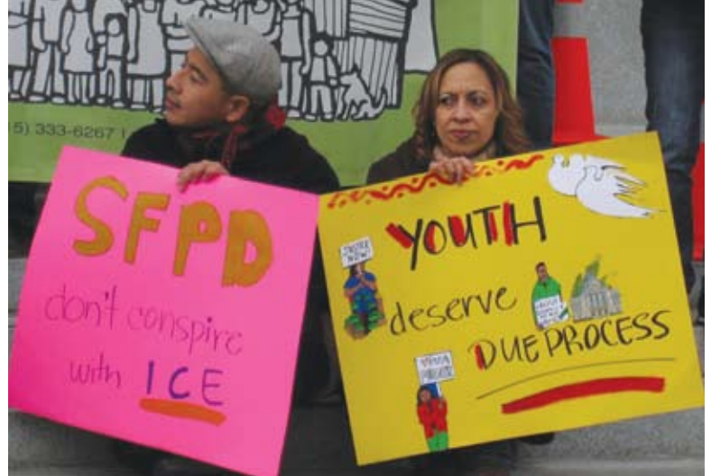
Rallying for the due process rights of immigrant youth, the Caucus plays a leading role in a multi-ethnic coalition that challenges the increasing cooperation between local law enforcement and federal immigration authorities.