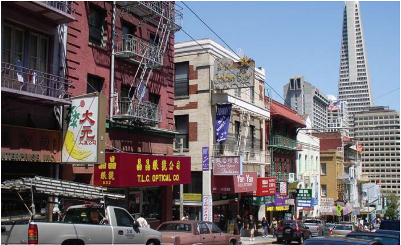
The Caucus’s advocacy and legal services in housing and community development protect affordable housing and neighborhoods—such as San Francisco’s Chinatown—for low income residents.

The Asian Law Caucus continues to represent hundreds of residents facing uninhabitable housing conditions, illegal rent increases, landlord harassment, and evictions. On the community development front, we partner with neighborhood groups to ensure that the needs of our diverse communities are served. Our commitment to the quality of life for San Francisco’s seniors inspires all aspects of our work.