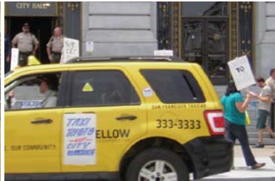
Cover photos (left to right): May Day march, Tet festival, rallying for immigrant rights.